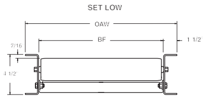
Single roller design