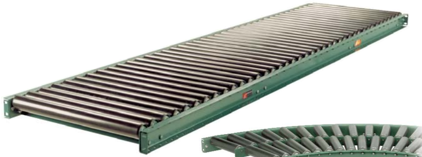
Double roller design

24 HOUR SHIPMENTS INCLUDE ALL 1-FOOT INCREMENTS 1'-0" TO 10'-0" ON STRAIGHT SECTIONS