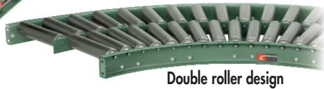
Double roller design