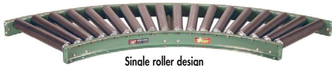
Single roller design