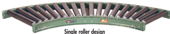
Single roller design