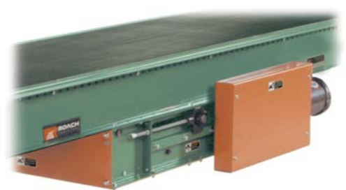
OPTIONAL CENTER DRIVE