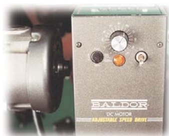
OPTIONAL DC VARIABLE SPEED CONTROLLER

ELECTRICAL CONTROLS: Magnetic starter (one direction or reversible); One direction manual starter; Momentary start/stop push button station; Forward/reversing /stop push button station. Mounting and pre-wiring for units up to 12' long.