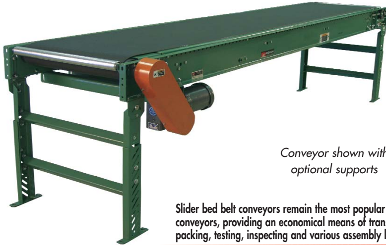
Conveyor shown with optional supports

24 HOUR SHIPMENTS INCLUDE ALL 1-FOOT INCREMENTS 5'-0" TO 100'-0"