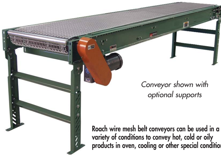
Conveyor shown with optional supports

Roach wire mesh belt conveyors can be used in a variety of conditions to convey hot, cold or oily products in oven, cooling or other special conditions.