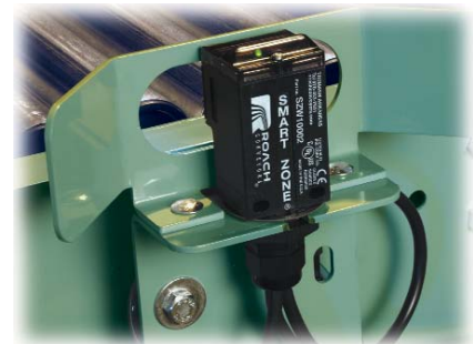
PHOTO SENSOR MOUNT