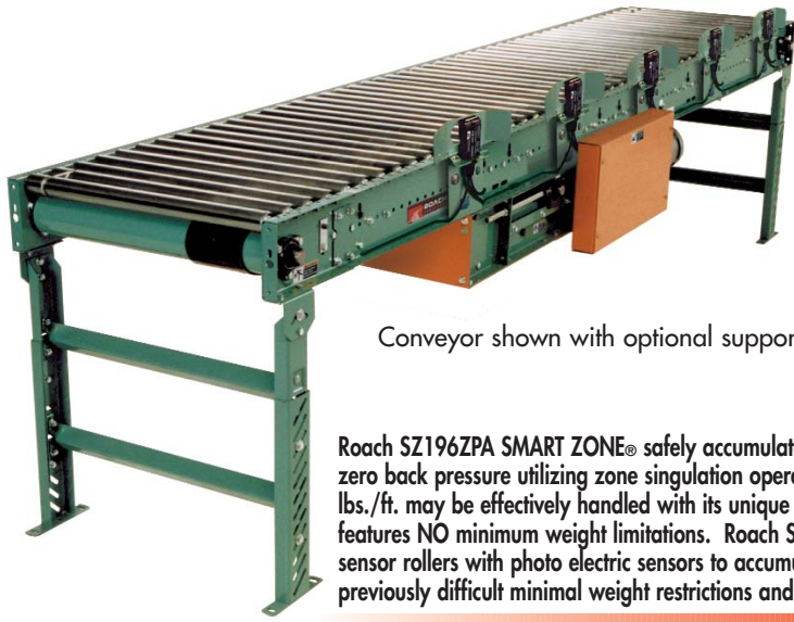
Conveyor shown with optional supports

Roach SZ196ZPA SMART ZONE® safely accumulates packages with zero back pressure utilizing zone singulation operation. Loads up to 125 lbs./ft. may be effectively handled with its unique design. This conveyor features NO minimum weight limitations. Roach SMART ZONE® replaces sensor rollers with photo electric sensors to accumulate products with previously difficult minimal weight restrictions and is easy to install.