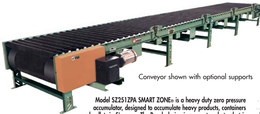
Conveyor shown with optional supports

Model SZ251ZPA SMART ZONE® is a heavy duty zero pressure accumulator, designed to accumulate heavy products, containers and pallets in 5' zones. The Roach design incorporates photo electric sensors--instead of sensor rollers, eliminating many common problems associated with conveying wooden pallets. Products do not touch during accumulation and are singulated individually off of conveyor. Heavy loads weighing up to 3000 lbs. may be safely accumulated with Roach SMART ZONE®.