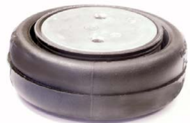
HEAVY DUTY AIR BAG