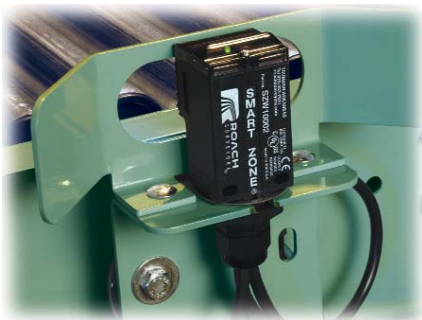
PHOTO SENSOR MOUNT

DEFUSED SMARTZONE: Photoeyes mounted below tread rollers.